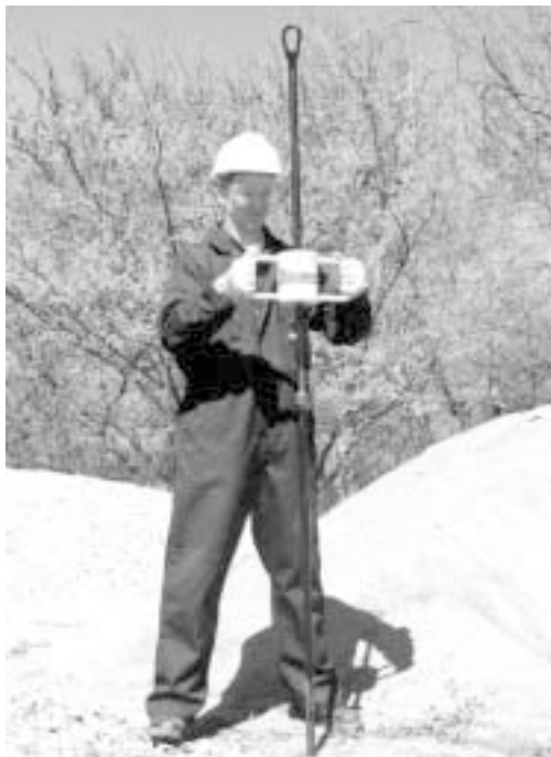
Figure 2. With the tool string aligned for driving, lift the slide hammer to a comfortable height (as shown) and then quickly lower the hammer until it strikes the anvil. Maintain a constant hold on the hammer handles while driving.